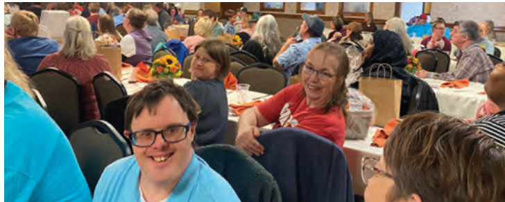
We had a full house at Brookhall Event Center